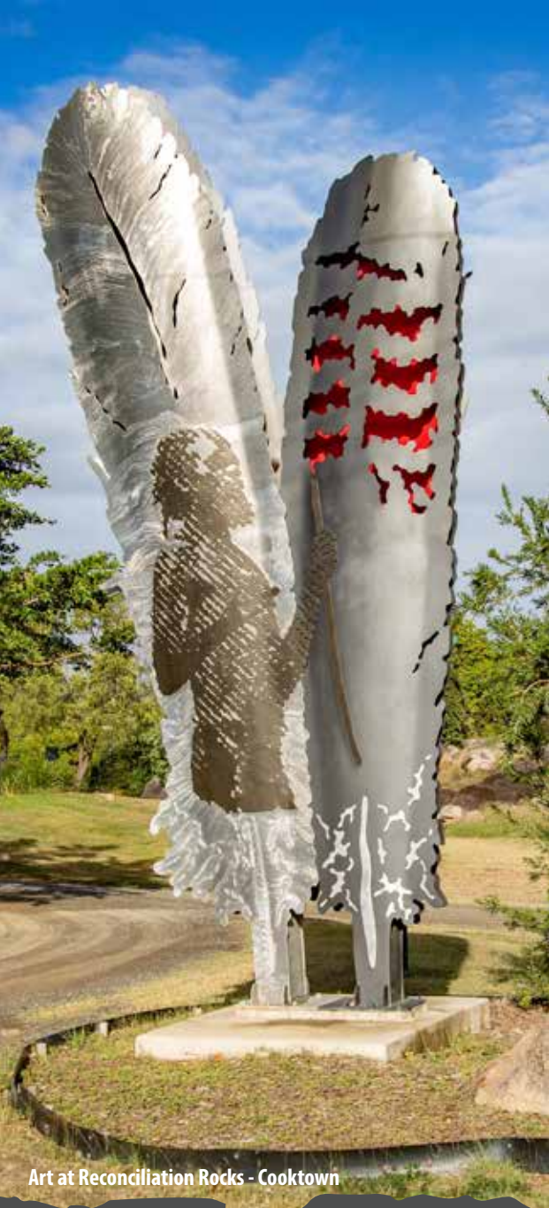
Art at Reconciliation Rocks - Cooktown