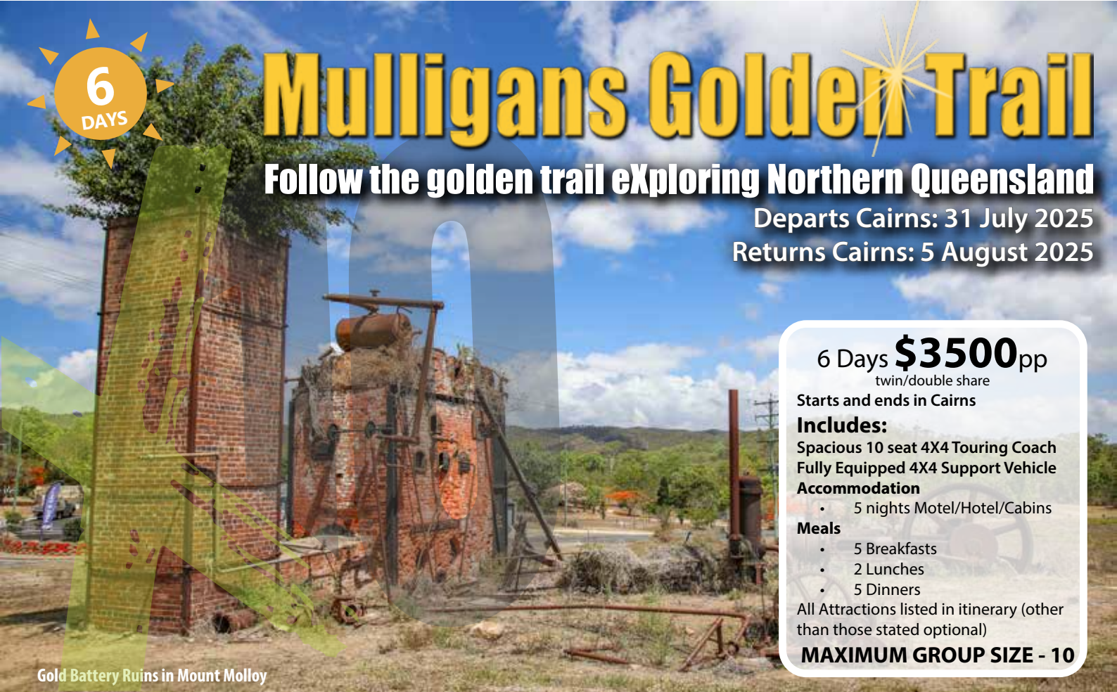
Gold Battery Ruins in Mount Molloy

Departs Cairns: 31 July 2025 Returns Cairns: 5 August 2025