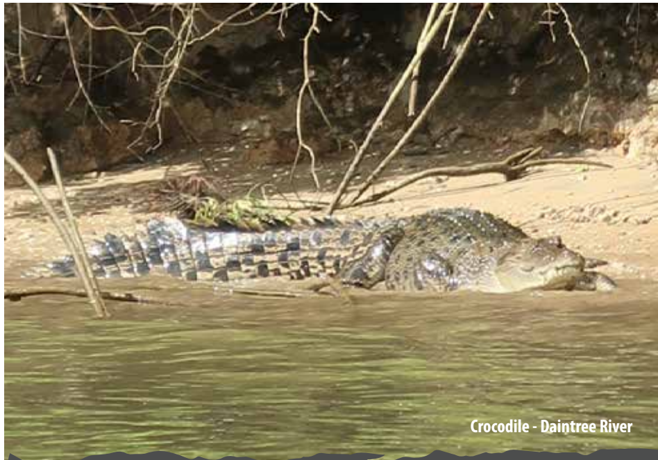
Crocodile - Daintree River