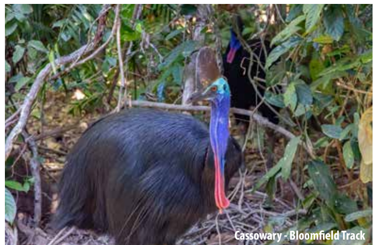
Cassowary - Bloomfield Track

Accommodation Heritage Lodge Daintree Rainforest