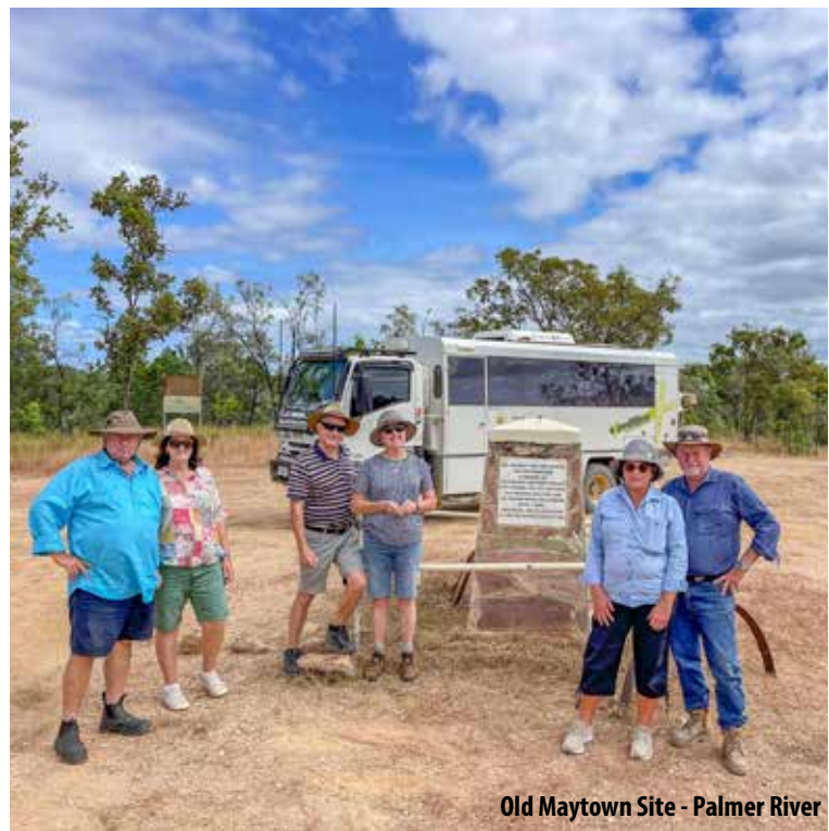
Old Maytown Site - Palmer River

With all of your gold securely packed away, wave goodbye to our new found gold-mining buddies and depart Palmerville Camp, bound for what remains of the old gold town of Maytown. Maytown was once the main township on the Palmer River