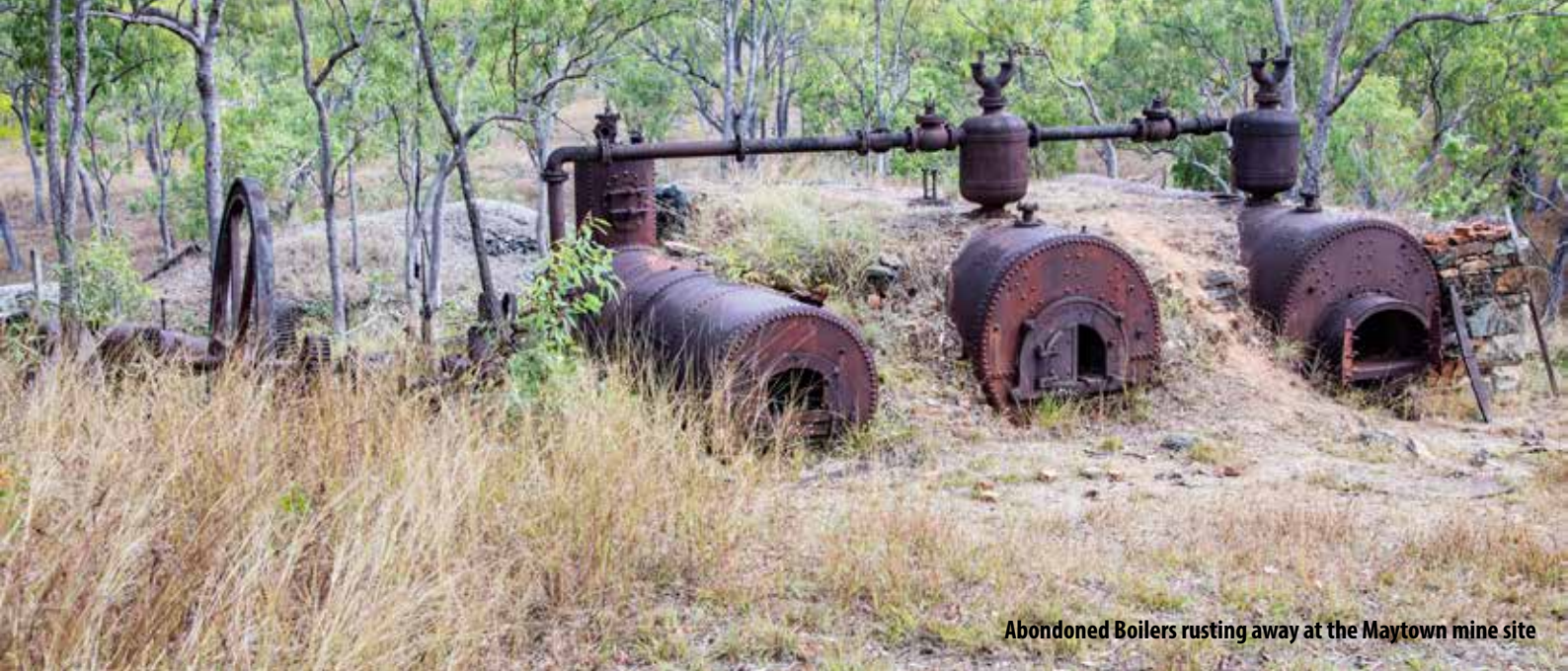
Abandoned Boilers rusting away at the Maytown mine site