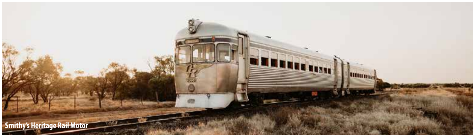
Smithy's Heritage Rail Motor

Thank you for travelling on the Trailblazer Reunion - One Final Fling. We know you will have plenty of amazing stories and pictures to show your family and friends.