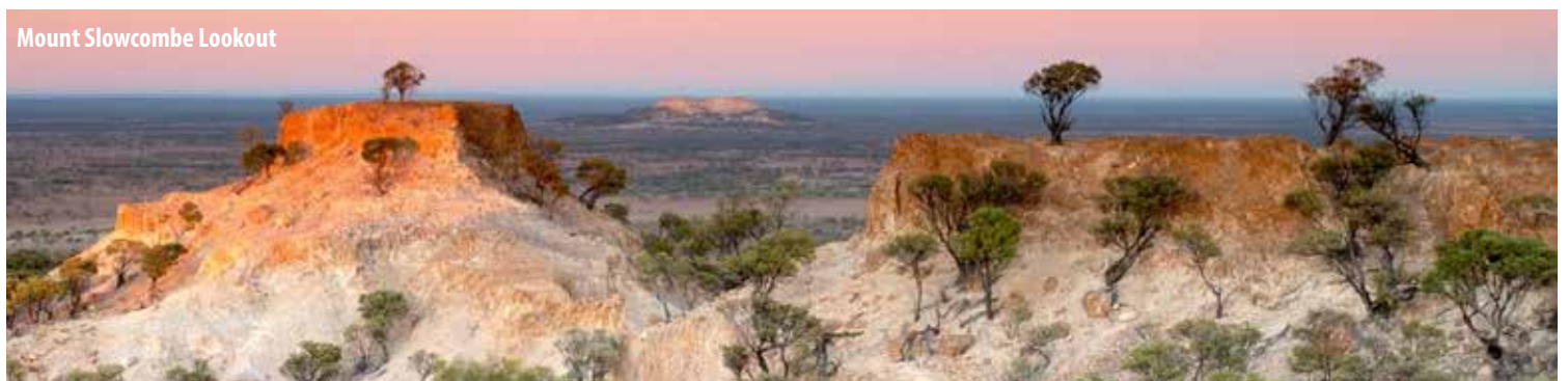
Mount Slowcombe Lookout