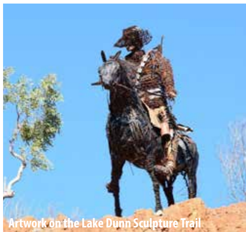
Artwork on the Lake Dunn Sculpture Trail