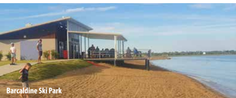
Barcaldine Ski Park

All Aboard! Experience a heritage Rail Motor journey on one of