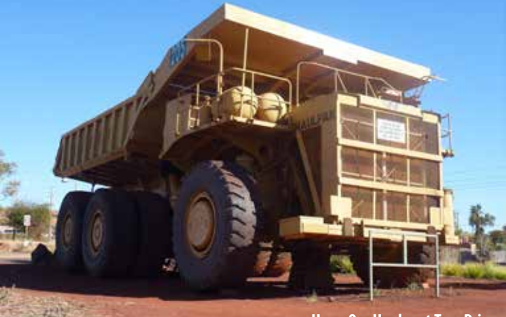
Huge Ore Hauler at Tom Price