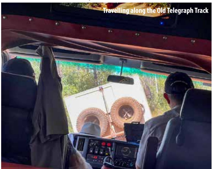
Day 12 Wednesday, 14 June 2023 Eliot Falls to Loyalty Beach Meals BLD

Accommodation eXpedition10 tents with stretcher beds and linen