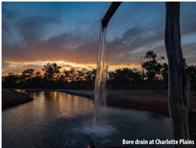
Bore drain at Charlotte Plains