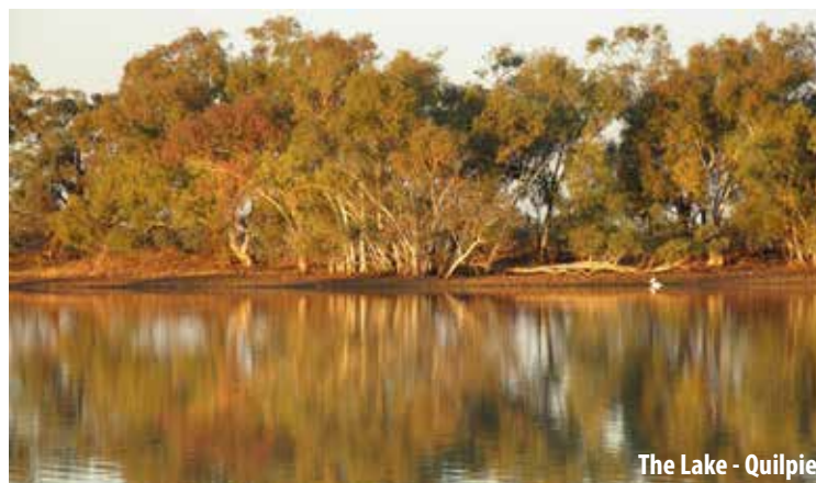
The Lake - Quilpie

Accommodation – The Lake Cabins with shared facilities