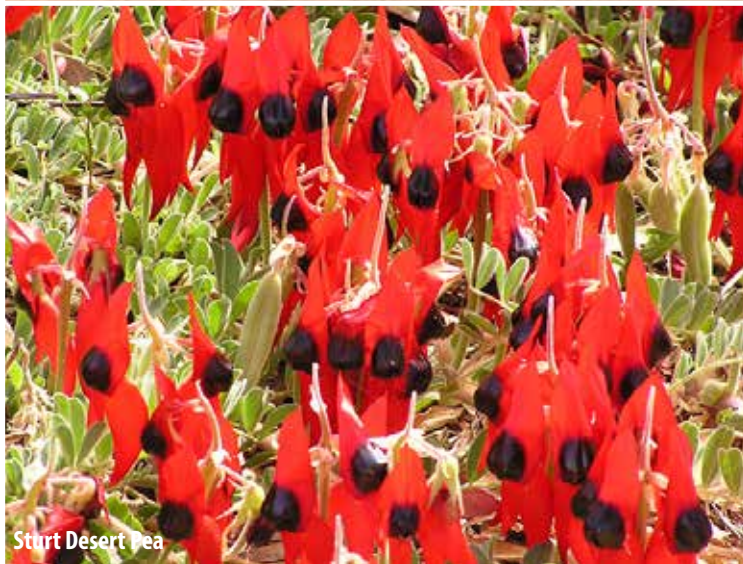
Sturt Desert Pea