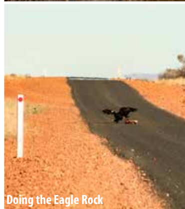
Doing the Eagle Rock