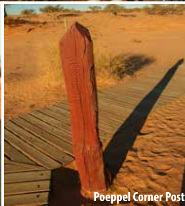
Poeppel Corner Post