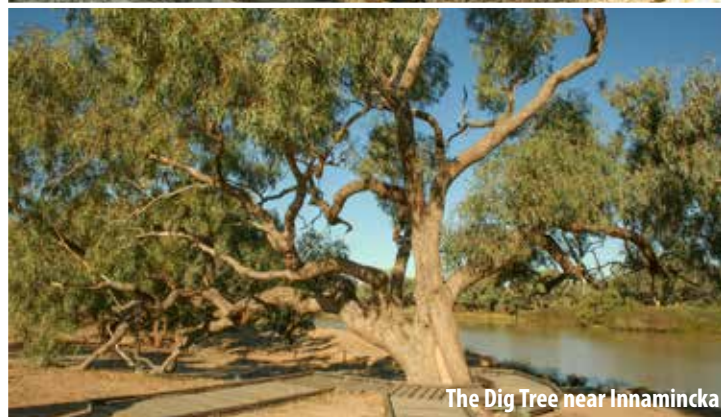
The Dig Tree near Innamincka