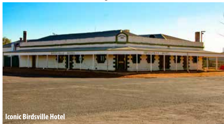
Iconic Birdsville Hotel