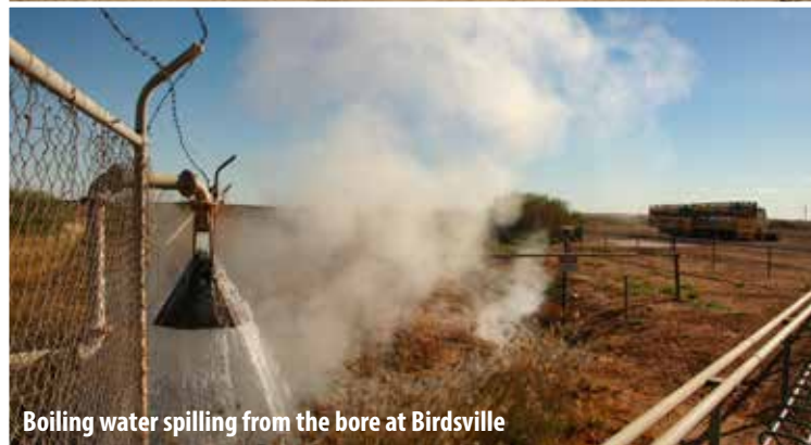
Boiling water spilling from the bore at Birdsville