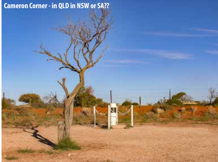
Cameron Corner - in QLD in NSW or SA??