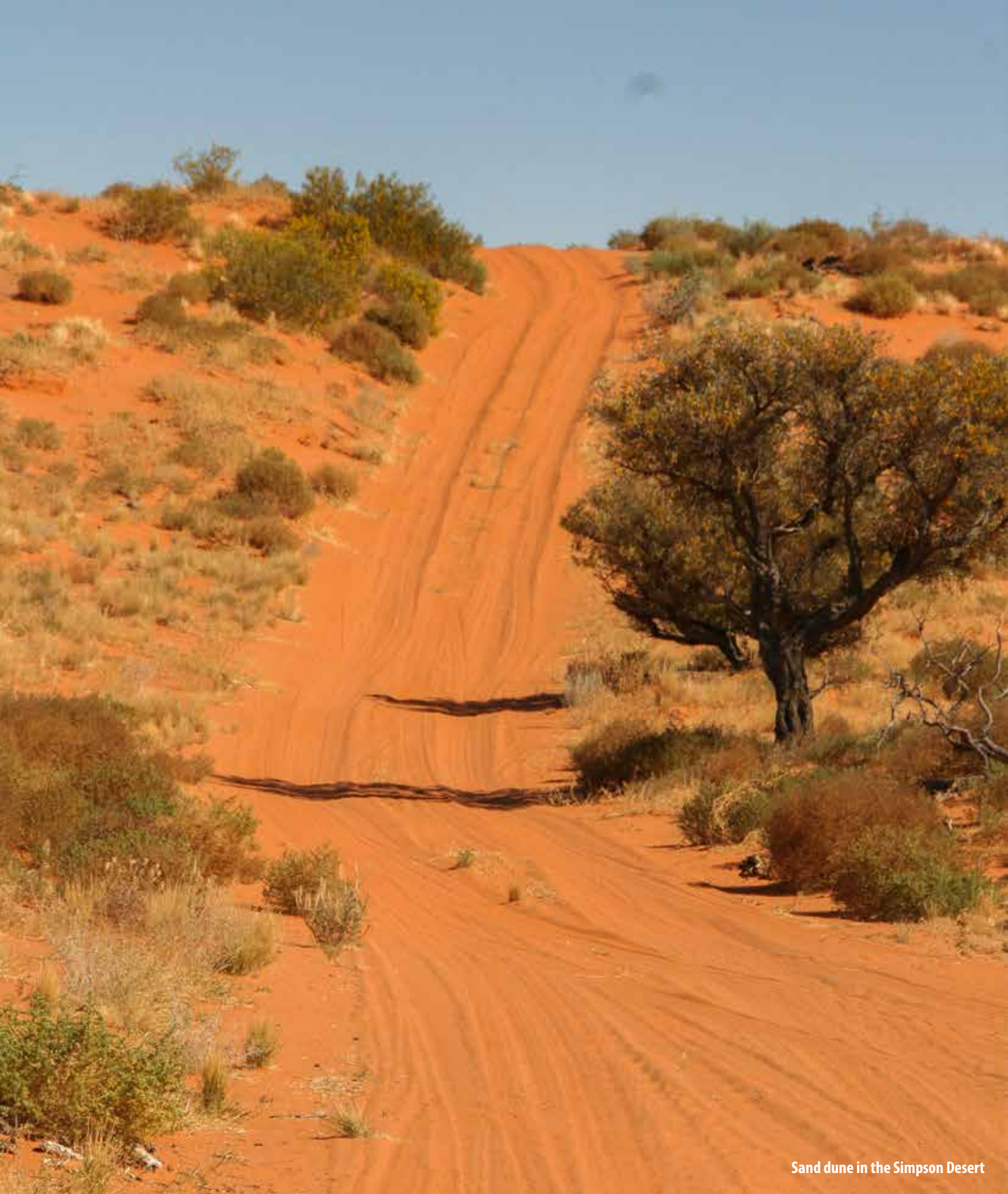
Sand dune in the Simpson Desert