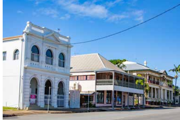
Beautiful Old Buildings Line The Main Street - Cooktown